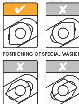
POSITIONING OF SPECIAL WASHER